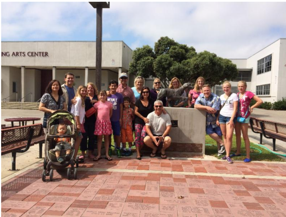
PLHS Class of 84 , with families, return to PLHS for a campus tour prior to their recent Reunion event.